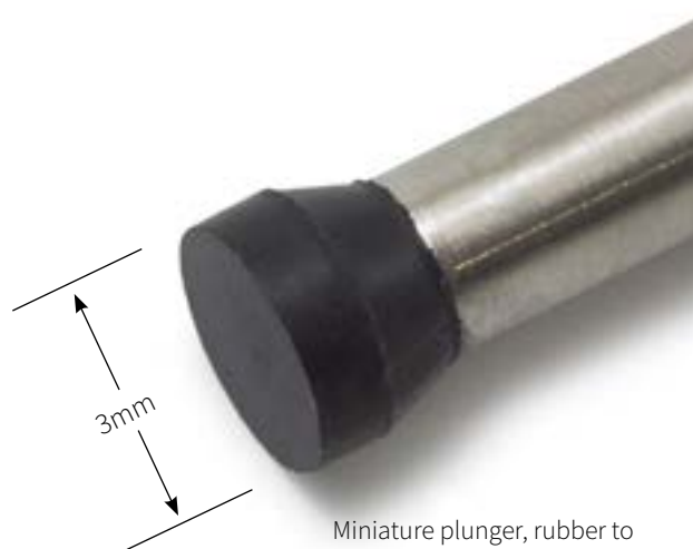
Miniature plunger, rubber to metal bonded for sampling and analysing sea water samples on mini-sub drone.

Our reputation for innovation and materials expertise has proved invaluable in the production of bonded seals and mouldings. You can expect unrivalled materials knowledge and in-tool moulding expertise when you partner with us. This is especially true where high performance and longevity in hazardous environments are of paramount importance.