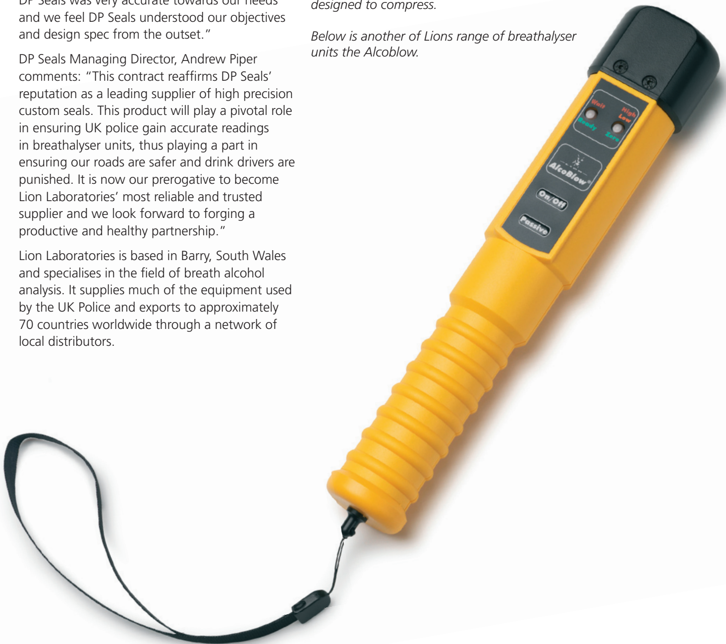
Below is another of Lions range of breathalyser units the Alcoblow.